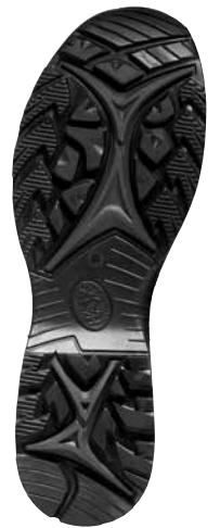
sole with special rubber mixture for winter