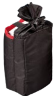
Extractable padded pouches for accessories