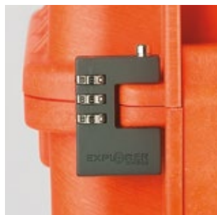
COMBINATION PADLOCK (Art. EXPL COMBILOCK)