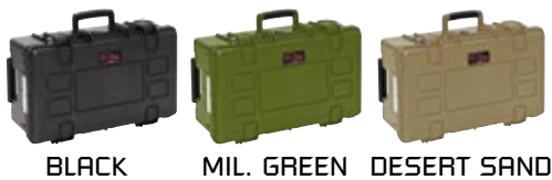
BLACK MIL. GREEN DESERT SAND