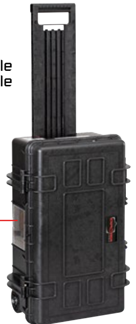
Shipping label holder (optional)