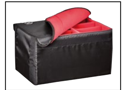
Padded top cover (optional)