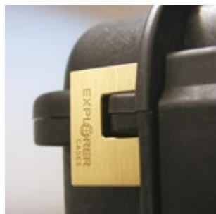
HEAVY DUTY BRASS PADLOCK W/KEY (Art. EXPL. PADLOCK)