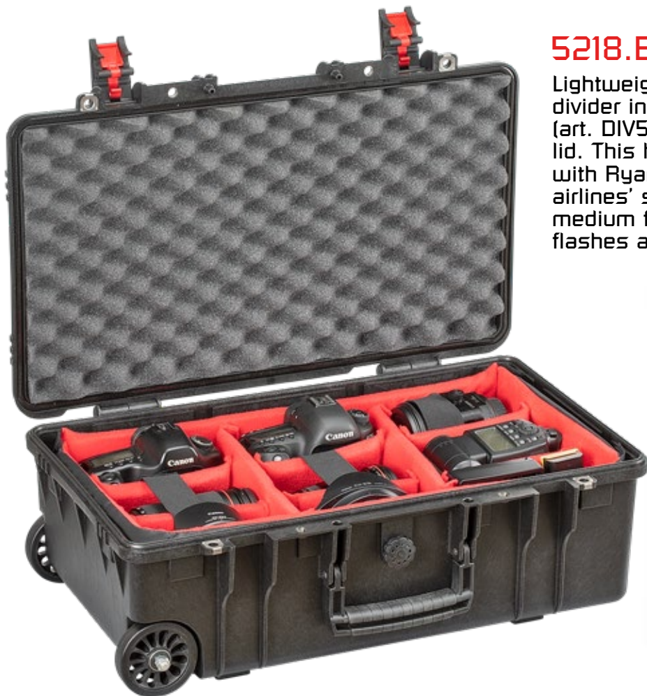
Self-oiling free running wheels