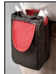
They can be worn with any belt