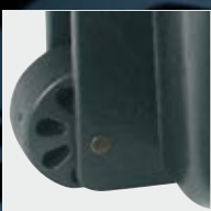
Self-oiling free running wheels