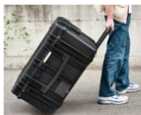
Wheels and extractable handle