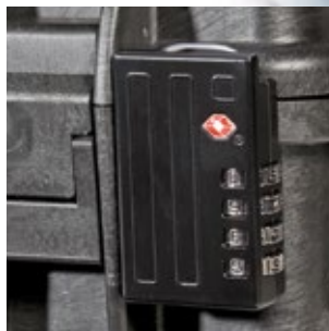
TSA COMBI PADLOCK (Art. EXPL TSA.DIGILOCK)