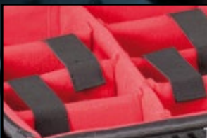
Elastic bands with Velcro are provided to fix small equipment