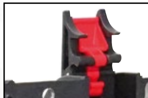
New pull release latch grants additional safety and avoids accidental opening