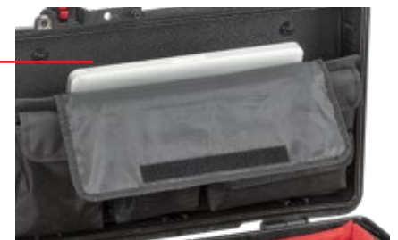
Padded laptop pouch