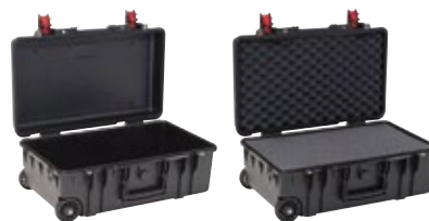
EMPTY WITH FOAM