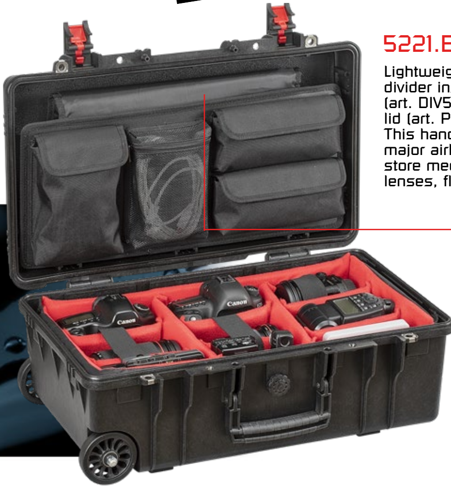
Self-oiling free running wheels

This hand-carry trolley complies with all major airlines' size restrictions. Ideal to store medium format digital cameras, lenses, flashes and other accessories.