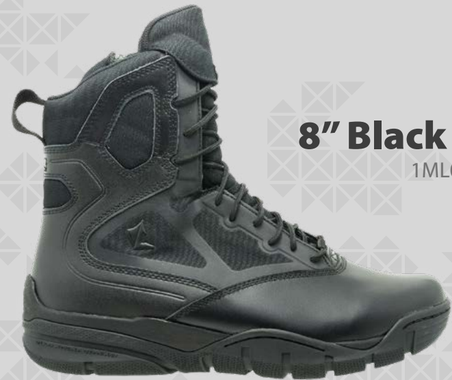
8" Black Ops 1ML043 BKO