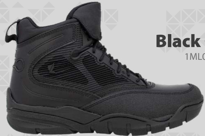
Black Ops 1ML007 BKO