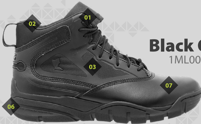
Black Ops 1ML008 BKO