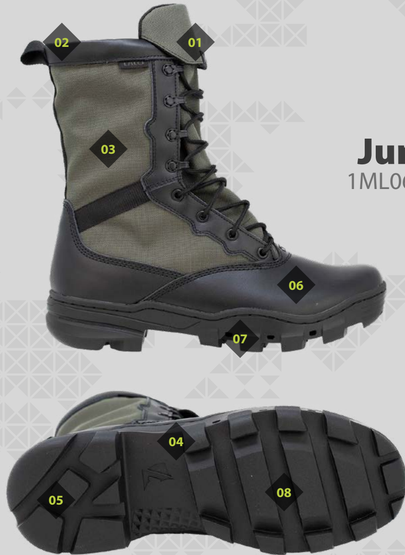
Jungle 1ML063 JNG