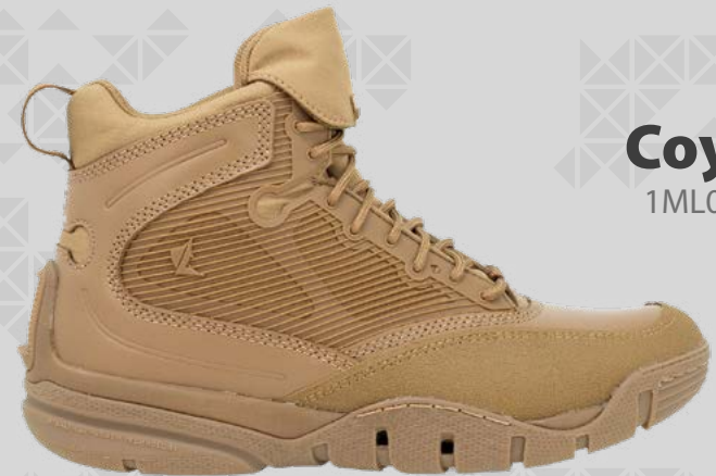
Coyote 1ML001 COY