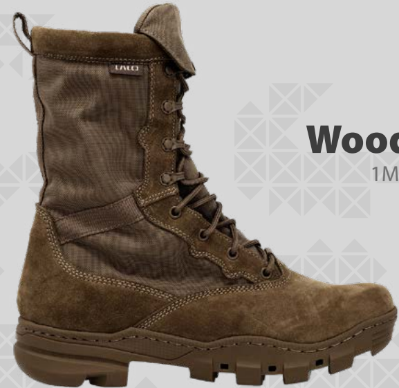
Woodland 1ML072 WOD