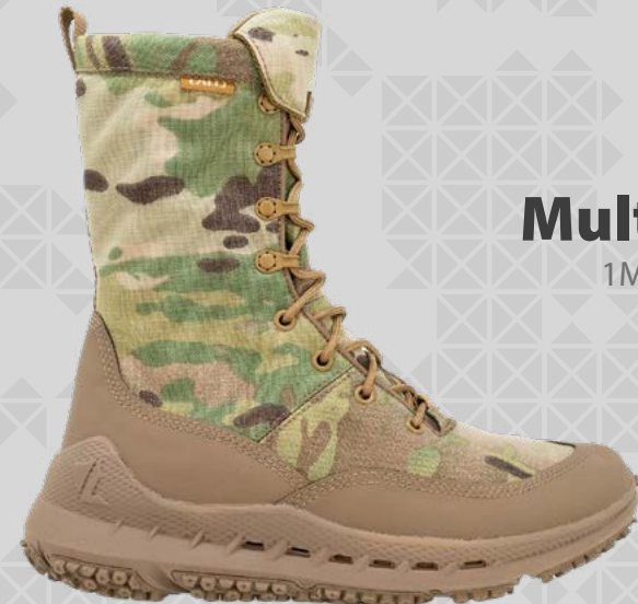
Multicam 1ML088 MUC