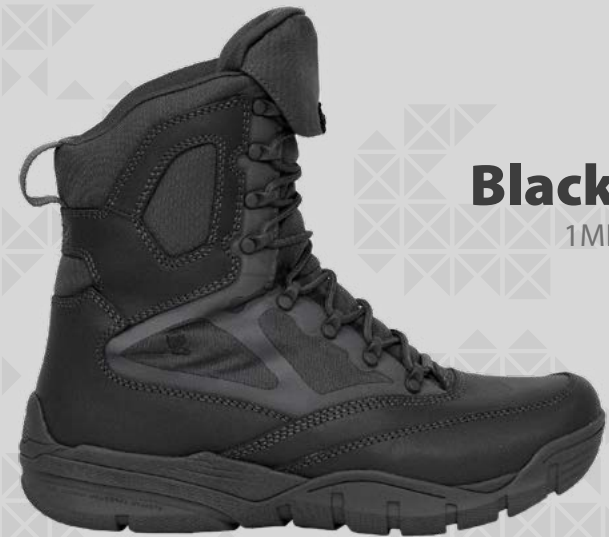
Black Ops 1ML083 BKO