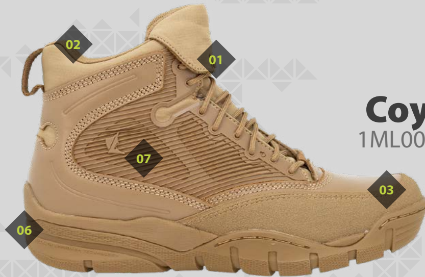
Coyote 1ML007 COY