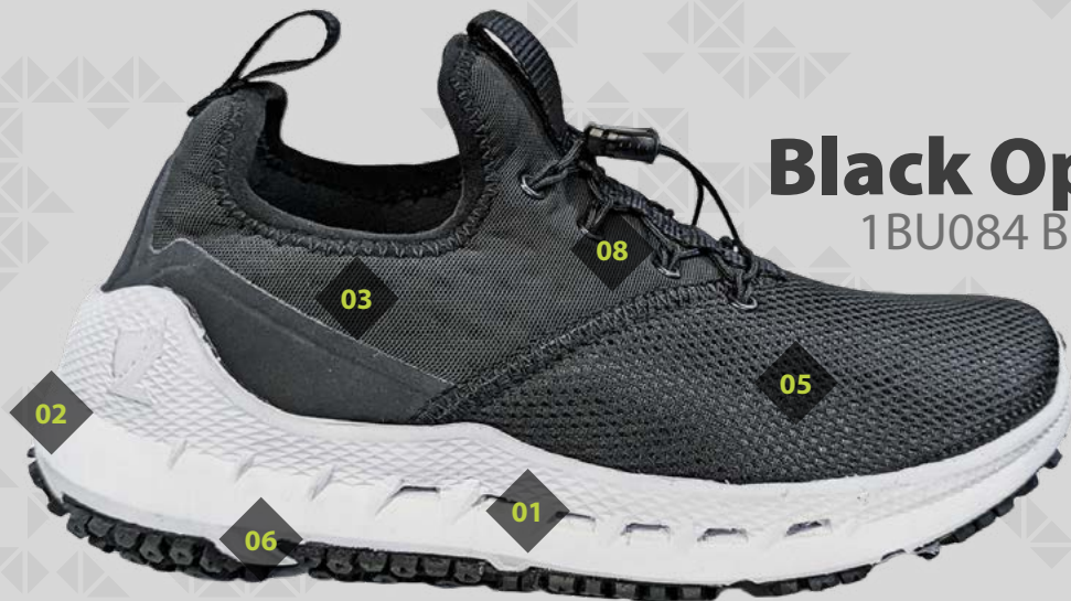
Black Ops 1BU084 BLW