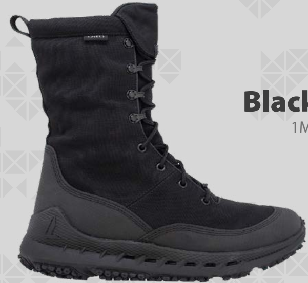
Black Ops 1ML088 BKO