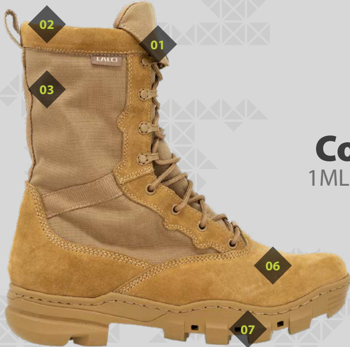
Coyote 1ML072 COY