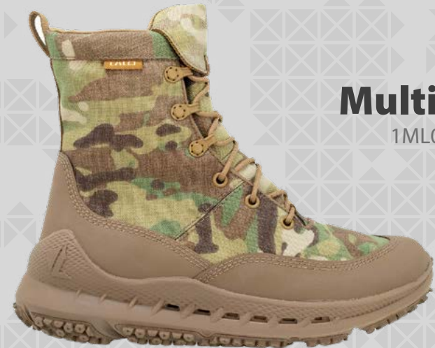
Multicam 1ML087 MUC