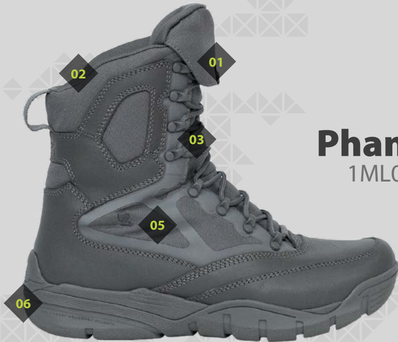
Phantom 1ML083 PGY