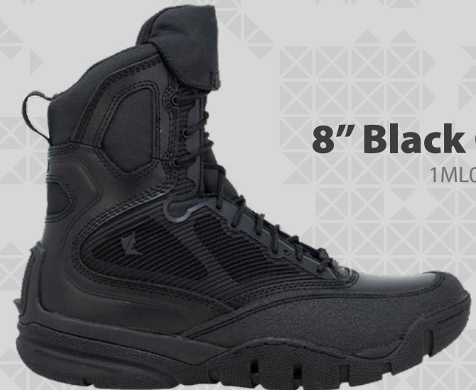
8" Black Ops 1ML041 BKO