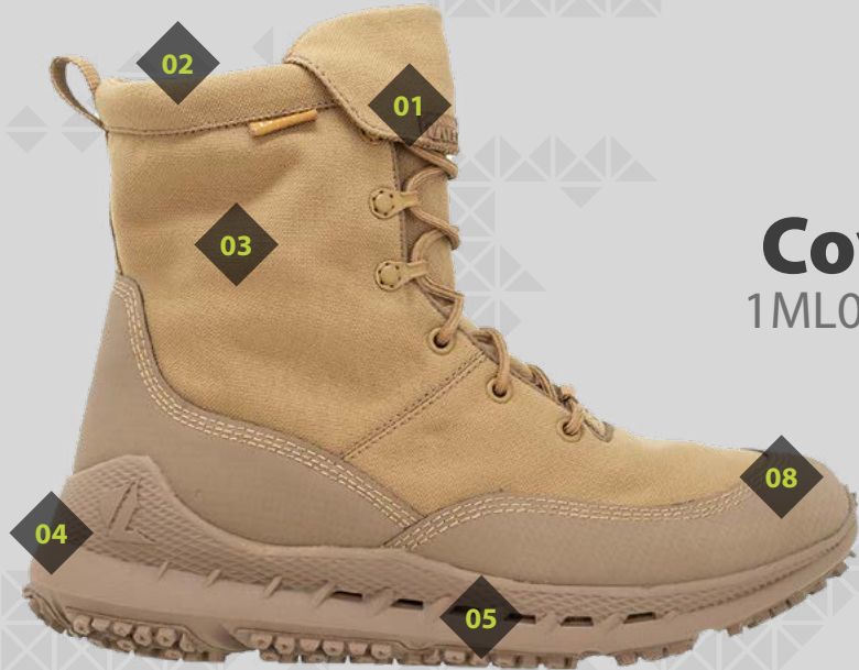
Coyote 1ML087 COY