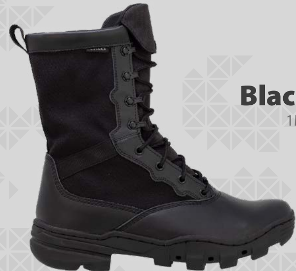
Black Ops 1ML063 BKO