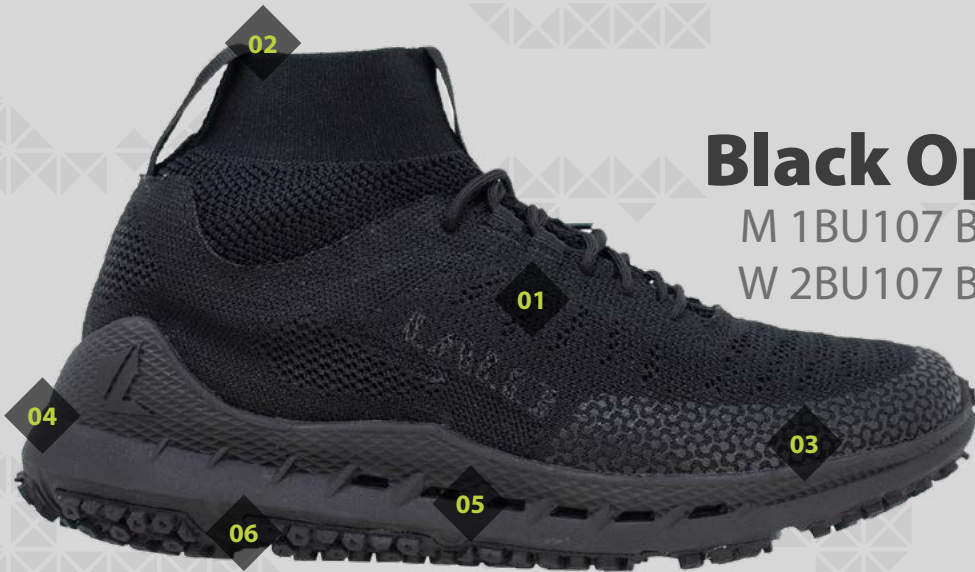
Black Ops M 1BU107 BKO W 2BU107 BKO