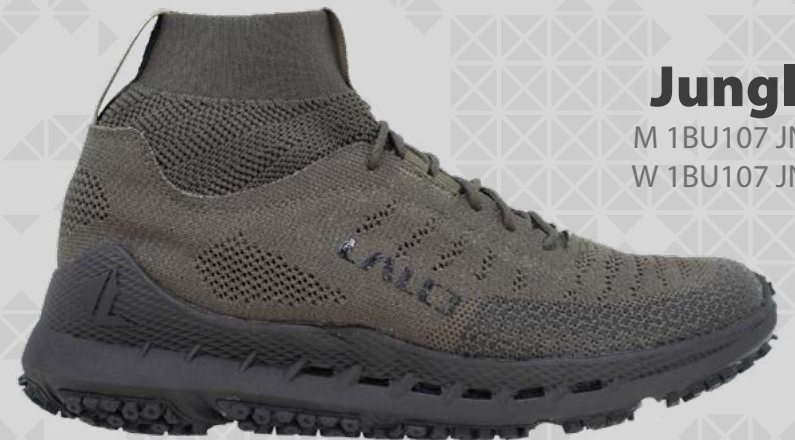
Jungle M 1BU107 JNG W 1BU107 JNG