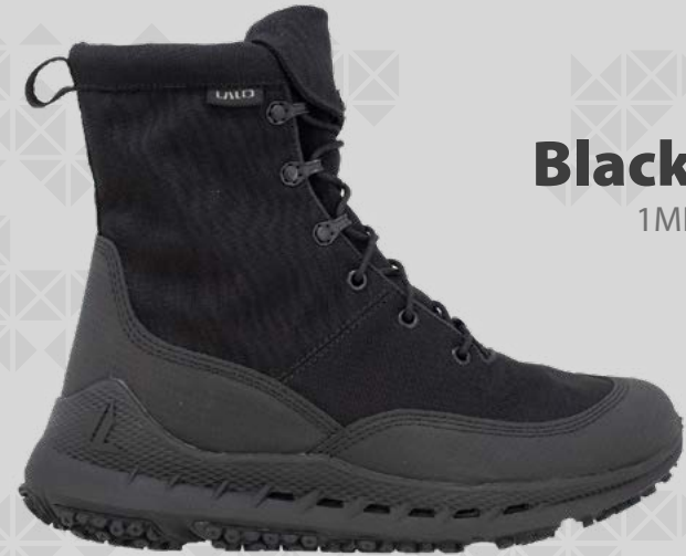
Black Ops 1ML087 BKO