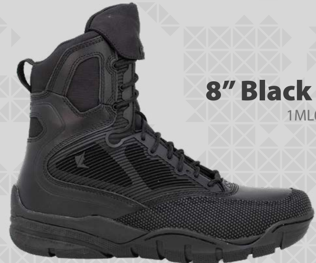
8" Black Ops 1ML047 BKO