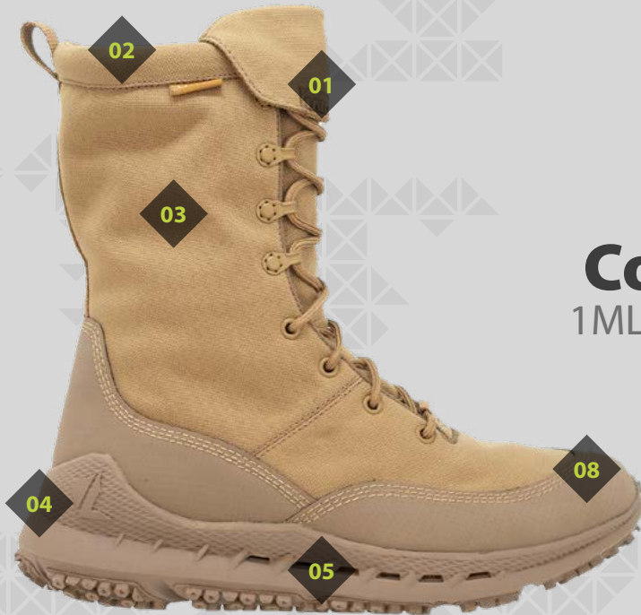
Coyote 1ML088 COY