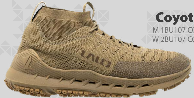
Coyote M 1BU107 COY W 2BU107 COY