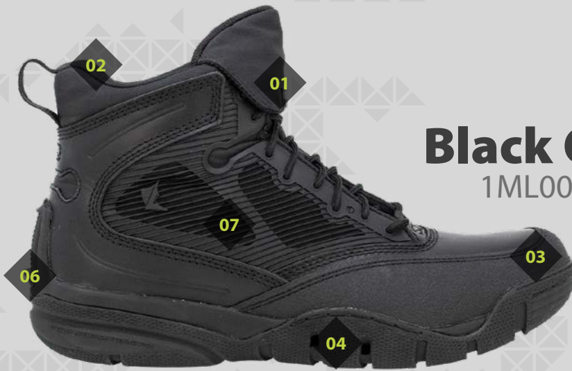
Black Ops 1ML001 BKO