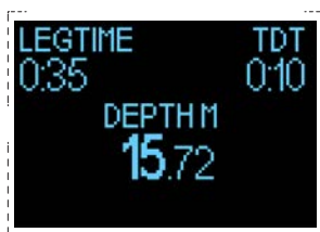
NAVY MODE Base Dive Screen

Find your way topside with an integrated GPS or under water with a full-tilt compass.