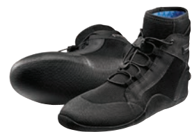
ALPHA BOOT 4MM