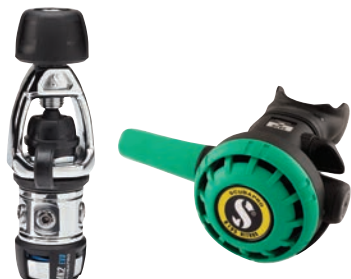
MK2 EVO / R195 NITROX