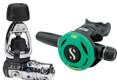
MK25 EVO / S560 NITROX