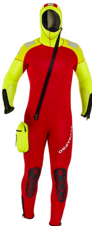
7MM HOODED STEAMER

Suits can be custom made for a minimum order of 50 suits.