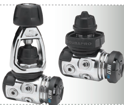
MK17 EVO INT/DIN