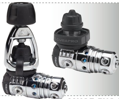
MK25 EVO INT/DIN