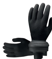
EASY DON DRY