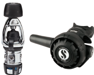
MK2 EVO / R195