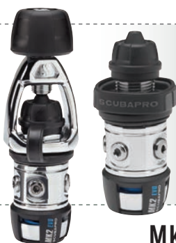
MK2 EVO INT/DIN