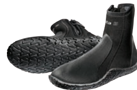
DELTA BOOT, 5MM