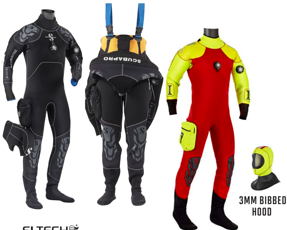
3MM BIBBED HOOD

Includes a hood, carry bag, low pressure hose, suspenders, repair kit and owners manual.