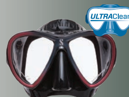
SYNERGY 2 TWIN