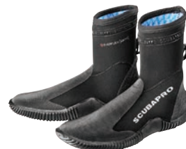
EVERFLEX BOOT, 5MM