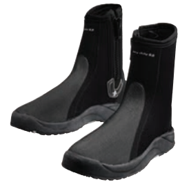
HEAVY DUTY BOOT 6.5MM