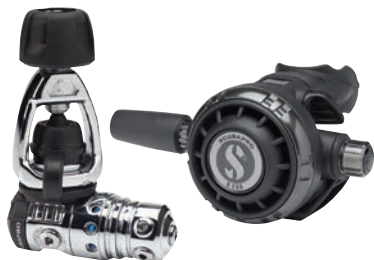
MK25 EVO / G260 TACTICAL