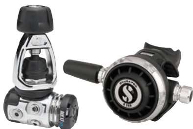
MK17 / G260