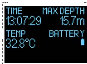
SUMMARY OF DIVE Additional Information