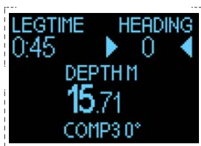
NAVY MODE Navigation screen