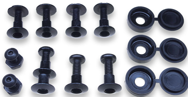
Fastener Kit SKU# K9H-TR-FSNR