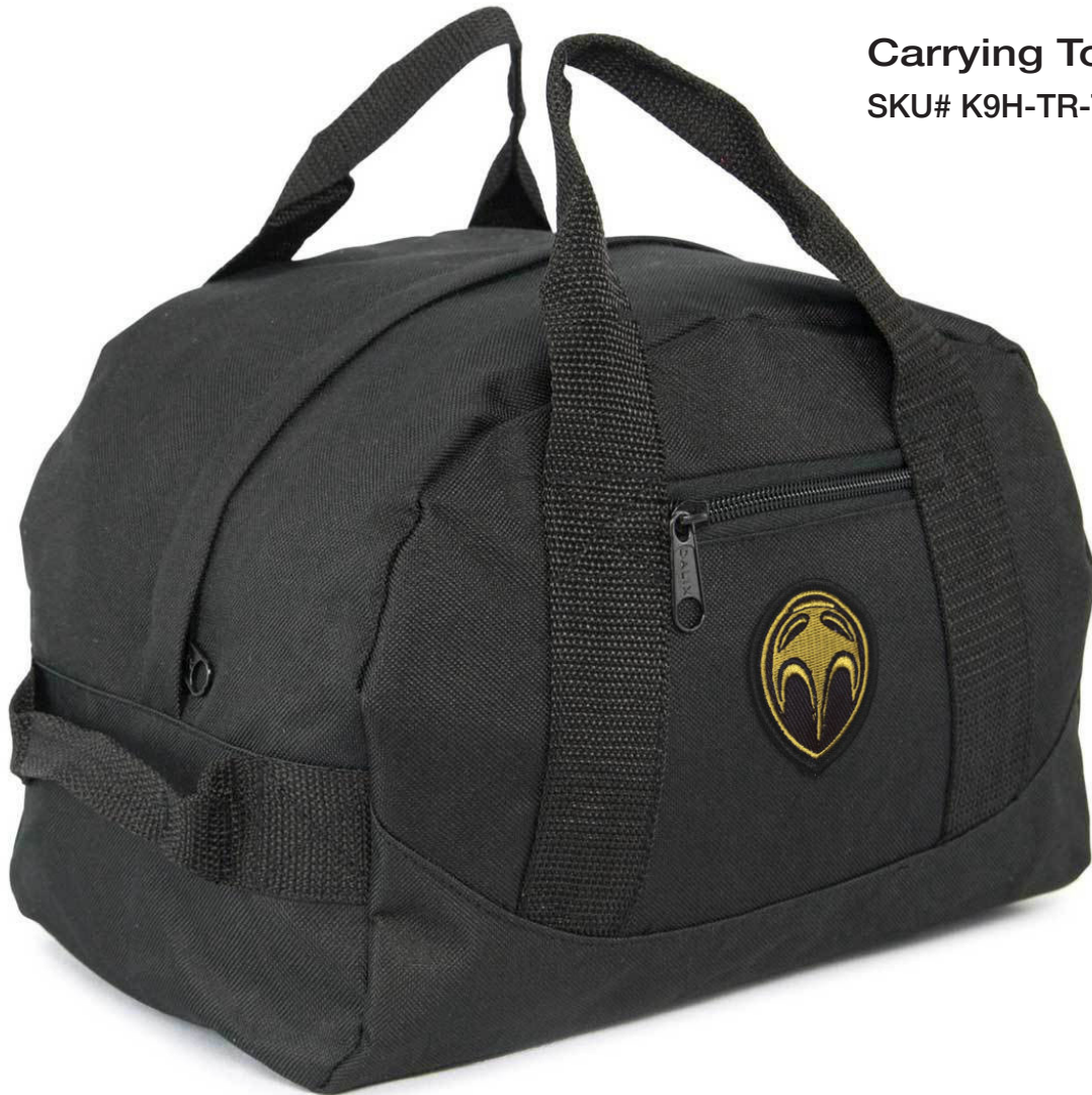
Carrying Tote SKU# K9H-TR-TOTE