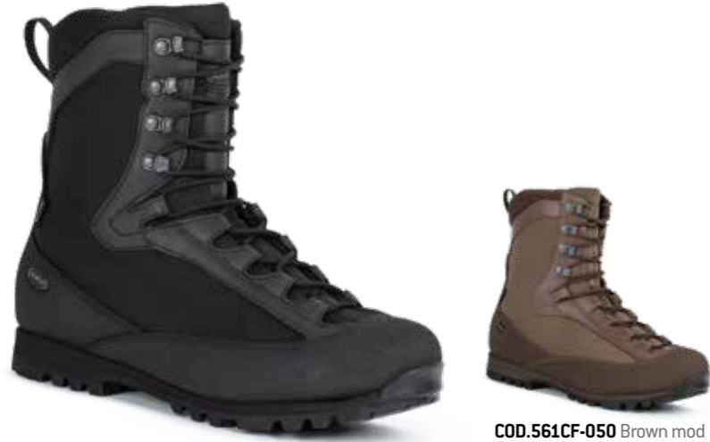
COD.561CF-050 Brown mod

The Pilgrim HL GTX Combat is a true multi-purpose highly breathable boot with outstanding support, stability and impact absorption. Thanks to these features, Pilgrim performs well in stability for demanding and dynamic conditions.