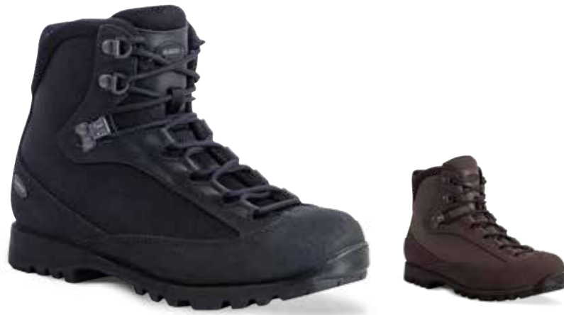
COD. 560CF-050 Brown mod

The Pilgrim GTX COMBAT is a true multi-purpose highly breathable boot with outstanding support, stability and impact absorption. Thanks to these features, PILGRIM GTX COMBAT performs well in stability for demanding and dynamic conditions. Model approved by the UK military across their services.