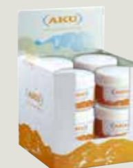
SHOE CARE CREAM COD. 215

Two products specifically recommended for the care of all AKU shoes and boots: the shoe care cream protects and revives the AKU leathers while the shoe care spray has a special formula to improve water and oil resistance of suede, leathers and fabrics. These products, all based on natural compounds, are easy to apply and do not alter the qualities of leathers and fabrics.