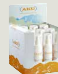
SHOE CARE SPRAY COD. 221