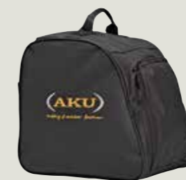
COD. 21100/052 BLACK