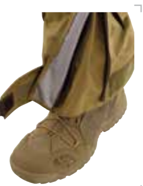
Lower leg zip with storm flap