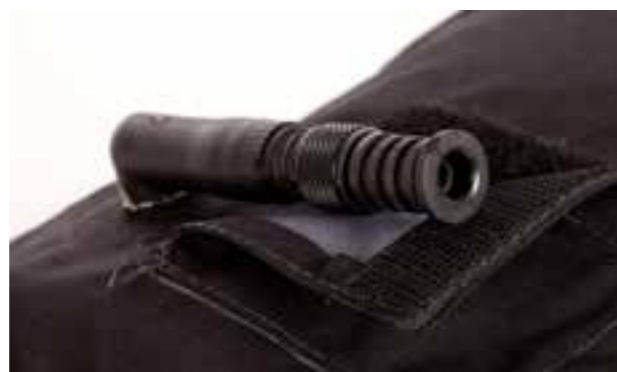
Oral inflation / deflation valve