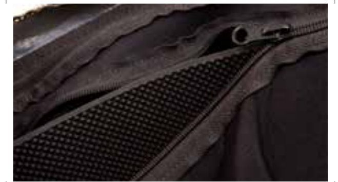
Neoprene Liner with removable semi rigid wall system