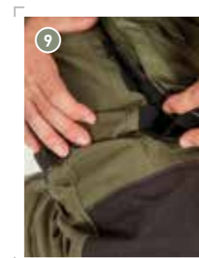
Thigh pocket on Molle platform