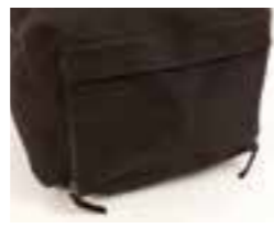
Zipped cover for integrated quick release system