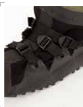
Compression strapped foot