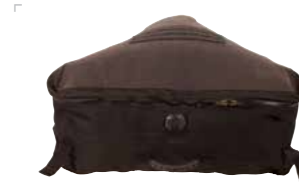
Top view with C7 valve, grab handle and securing loops