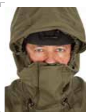
Fire retardant removable hood