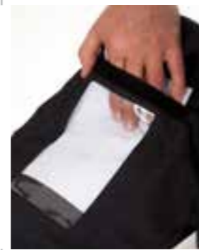
Windowed thigh map pocket