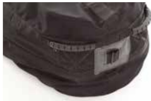
Manual d-ring lifting harness