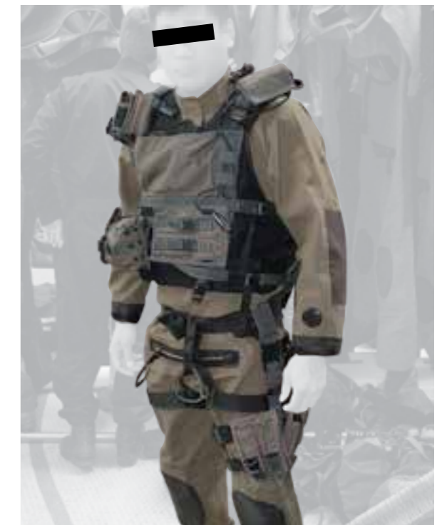
In service now. Above picture is lightweight swimmers suit