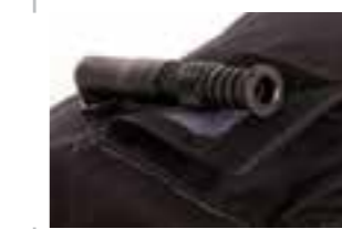
Oral inflation/deflation valve