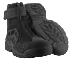
Water Spider in Black