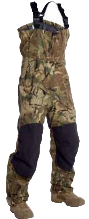
Available in salopettes