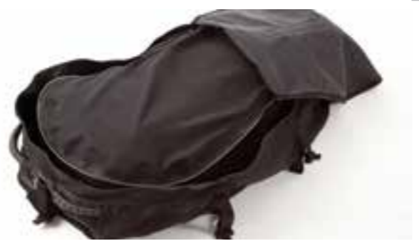
Outer bag to middle