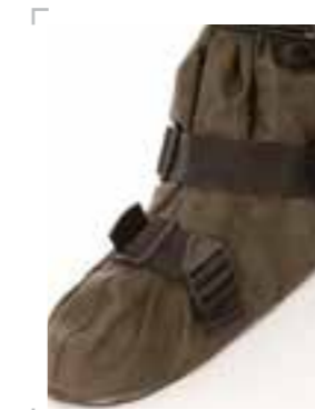
Boot adjustment webbing