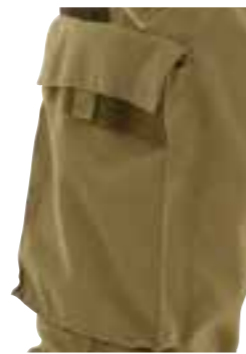
Fixed bellows pocket