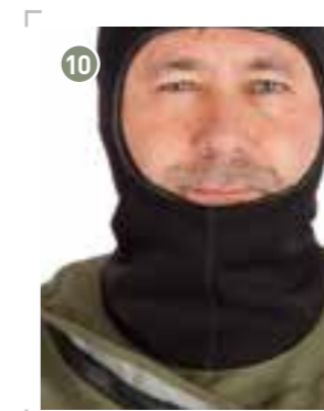
Removable neoprene hood