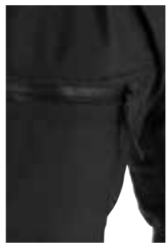
Plastic Aquaseal zips