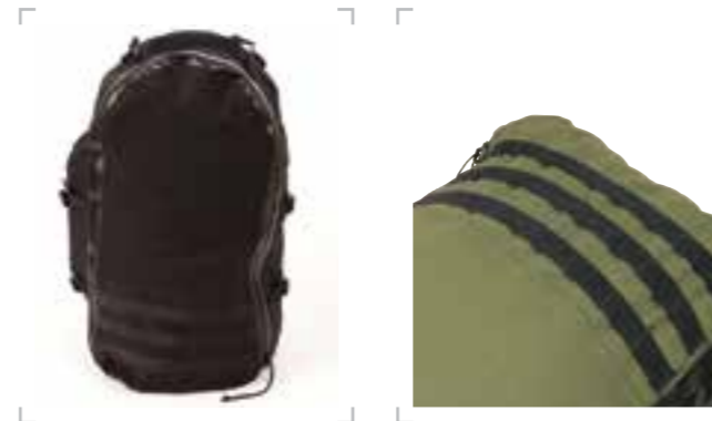
Front of bag including hydration bladder installed in elasticated panel