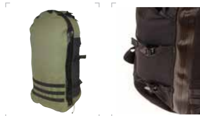
Front of bag showing Molle integration panel, aqua seal plastic zip and compression straps