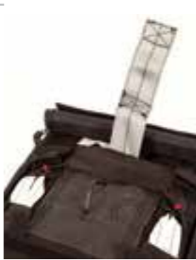
Integrated quick release system