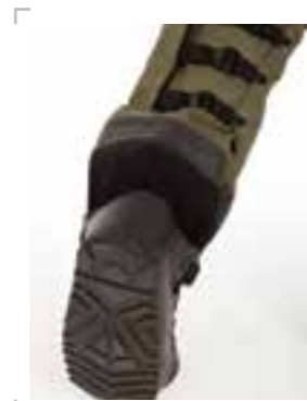
Slip resistant sole