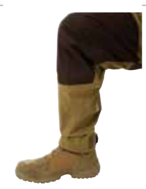
Cordura overlay knee and adjustable lower ankle