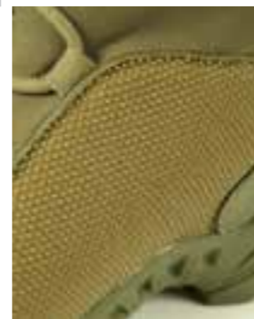
SuperFabric fast roping panel