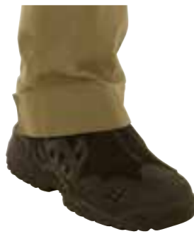
Adjustable ankle cover