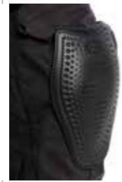
VIBRAM rubber compound knee pads

GORE-TEX® PYRAD® Fabric forms a stable char to protect the user. After heat or flame exposure the fabric will self extinguish and no hole formation or break open due to the GORE® PYRAD® Fabric technology.