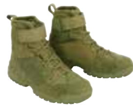
Water Spider in Green - laced option