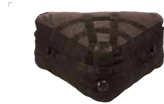
Top view with Molle interface and Kevlar reinforcement