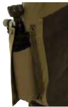
Cylinder suit inflation mount