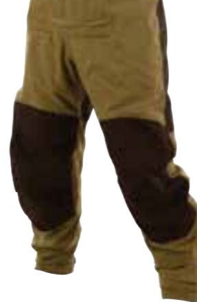
Smock and trouser combo