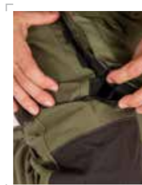
Thigh pocket on Molle platform