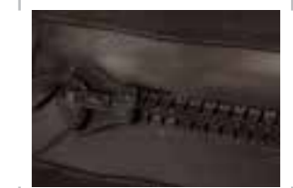
Dry plastic zip