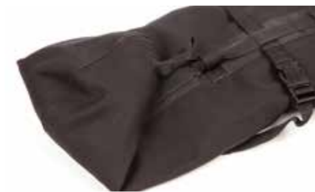
Adjustment strap for barrel lengths