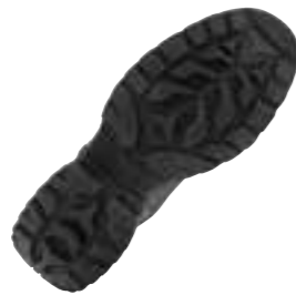
Anti-slip and oil resistant sole