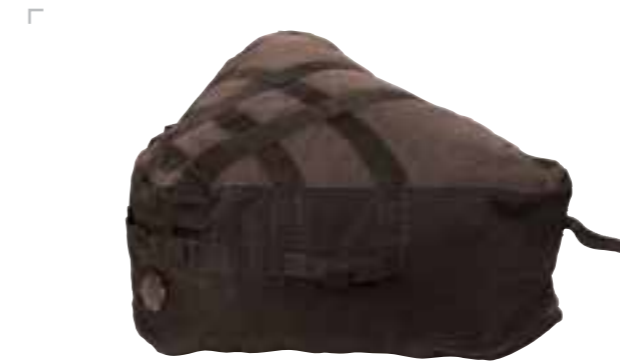
Bottom view with Kevlar reinforcement and load bearing webbing