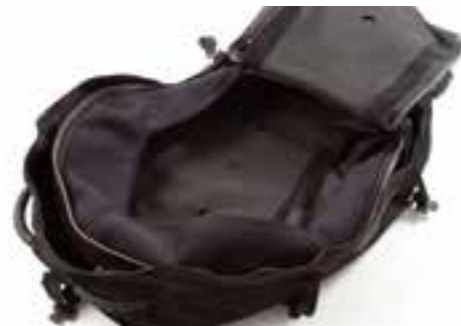
Three layer system (inner view)