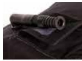
Oral inflation/deflation valve